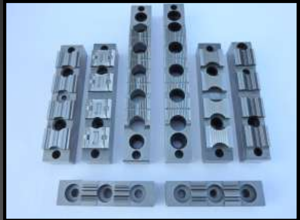
SLIT BLADES, PIERCE PUNCHES, DIE INSERTS